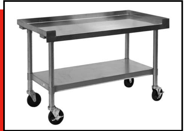
HEAVY-DUTY COOKLINE STAND