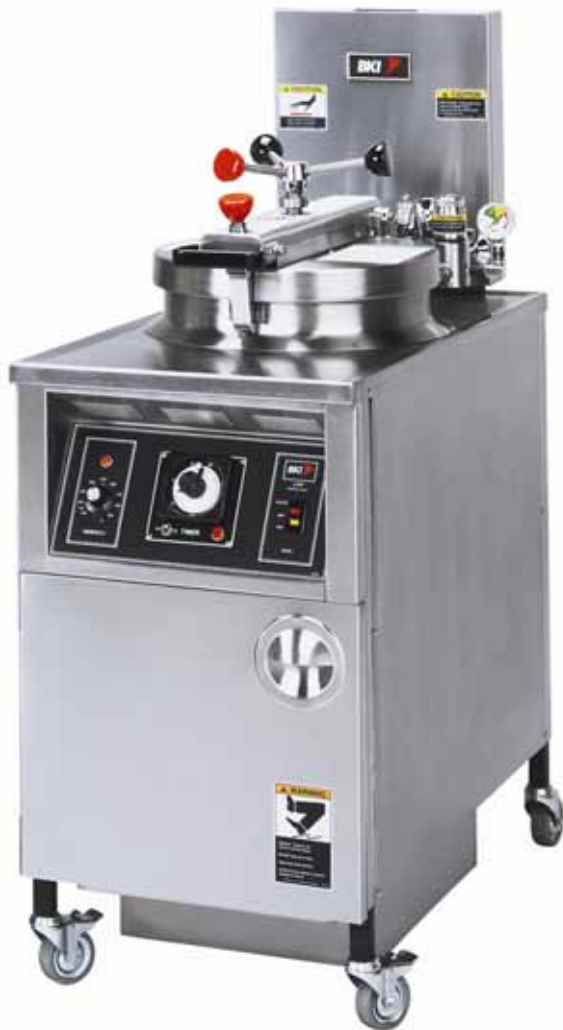
BKI's LPF-F Electric Pressure Fryer shown above