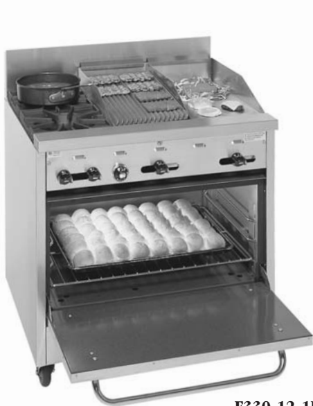
F330-12-1RB (shown with optional casters)