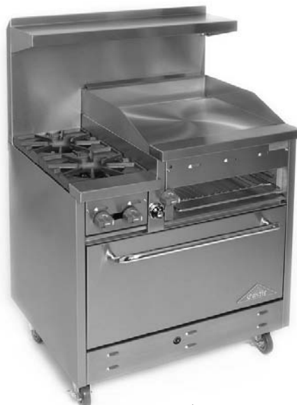
F330-24B (shown with optional casters)