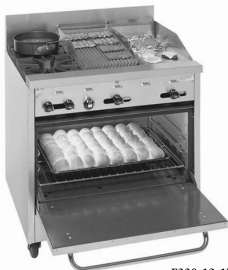
F330-12-1RB (shown with optional casters)