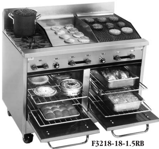
F3218-18-1.5RB (shown with extra racks and optional casters)