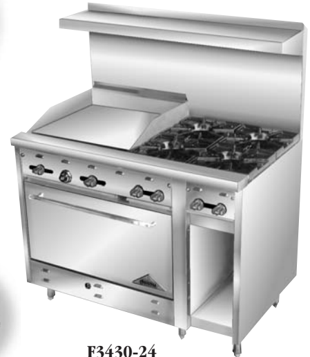
F3430-24 (shown with griddle on left)