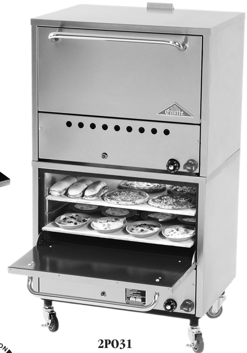
2PO31 (shown with optional casters)