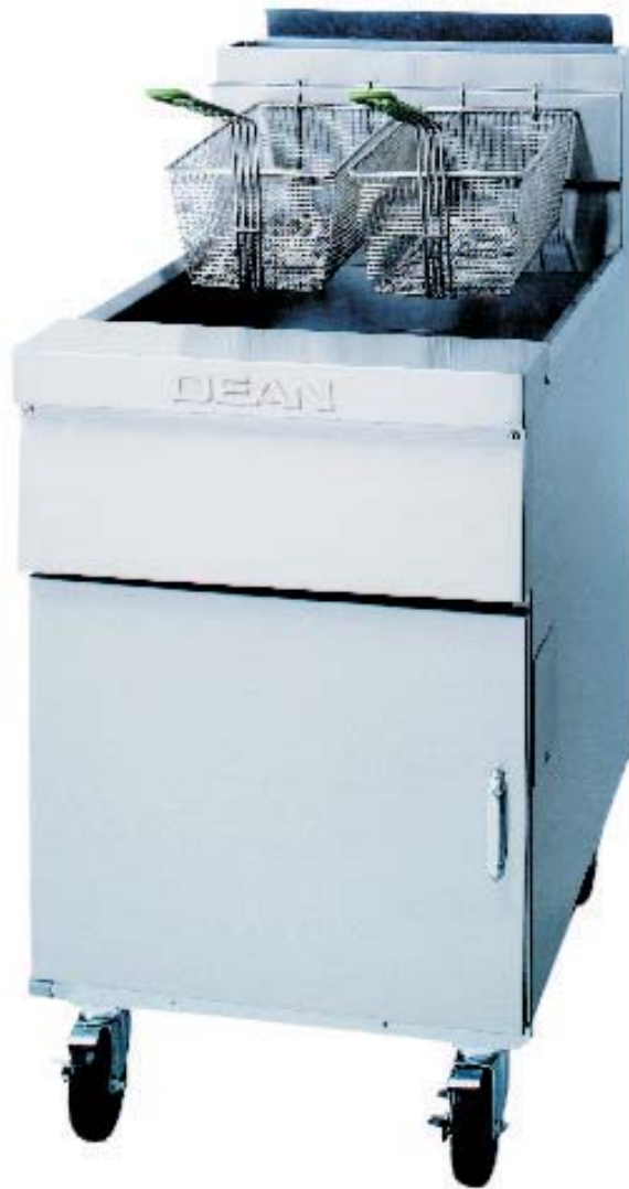
SM60G gas fryer standard with 150,000 BTU (37,783 kcal) (44 kW) burners and 60-75 lbs. (34-42 L) oil capacity (shown with optional casters).

Volume Frying Made Better Designed for volume frying and products requiring longer cook times