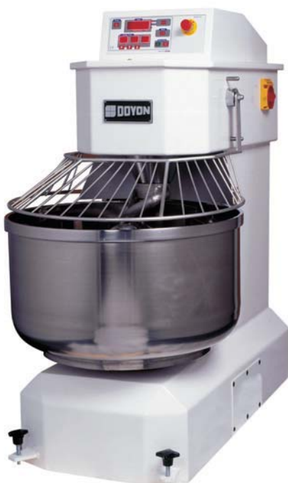
AEF035 AEF050 AEF080 AEF100 AEF120