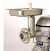
SM100HV (meat grinder)

Belt driven, 40 qts mixer with standard #12 attachment hub for slicer or grinder attachment.