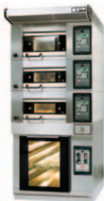
1T 1 pan (shown with optional proofer and hood)