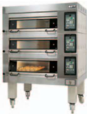
2T 2 pans