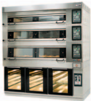
3T 3 pans (shown with optional low profile proofer)

Oven built in one piece (Modular baking chambers optional)