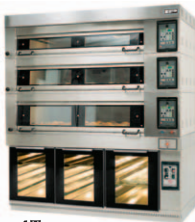
4T 4 pans (shown with optional low profile proofer)

For the artisan baker, Doyon offers the best choice for baking Old-World artisan-style crusty breads with thick and crispy crust but still soft inside. Our ovens offer perfect heat distribution and our outstanding steam injection system gives you complete control over your oven chamber. Doyon Artisan ovens are quick and easy to install and are the perfect choice for a variety of quality hearth breads, pastries, cookies, pies, cakes, pizzas, roasts, fast foods and much more.