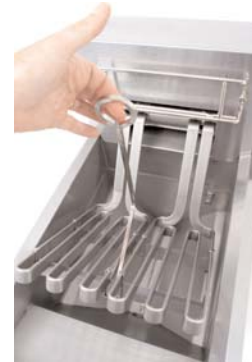
Combines swing-up elements with controlled burn-off cleaning (RE14 illustrated). Lift handle not available on 22 kW split pot element assembly.

This product incorporates technology developed for the Electric Power Industry under the sponsorship of EPRI, the Electric Power Research Institute.