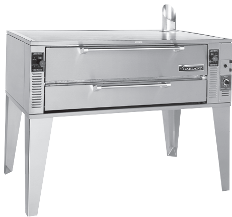
Model GPD60 (shown with optional stainless steel legs)