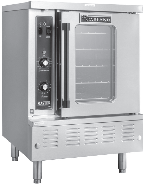
Model MCO -G-5-R