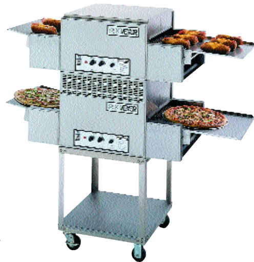
Model 314HX Stacked