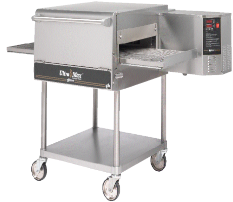
UM1854 (Single) with Optional Stand

The Holman Ultra-Max gas conveyor oven is covered by Star's one year parts and labor warranty.