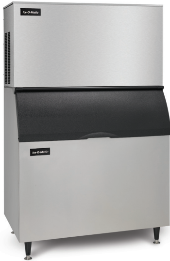
EMF2306 on B100