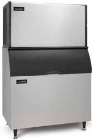
ICE2106 on B100