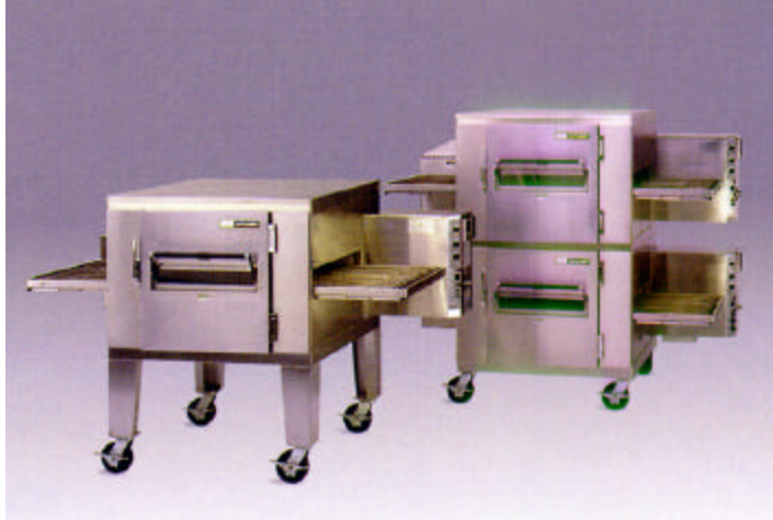
Ovens shown are Single & Double Oven systems with top, stand and accessories.

Model No. 1202 Model No. 1203 Model No. 1228 Model No. 1229