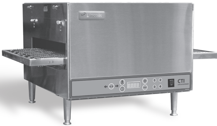
Shown with 31" (787 mm) standard conveyor.