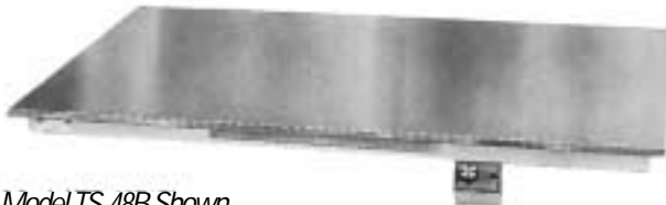
Model TS-48B Shown

All models available in 120, 208 or 240 VAC, single phase AC only.