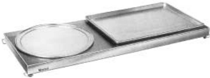
Model TS-48 Shown

Ideal for baked goods, plate warming, buffet line service, sauces, syrups, pizza, hot sandwiches, and more.