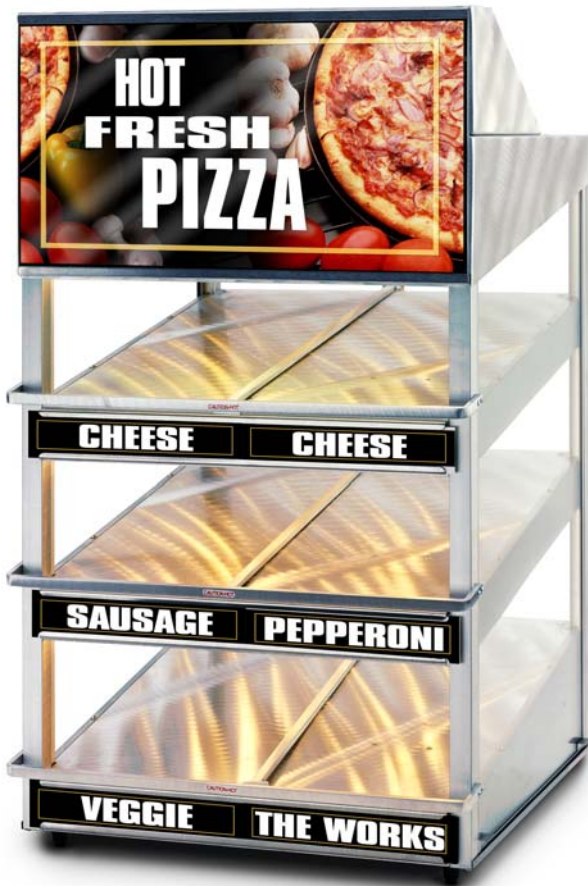
Model No. PDC3-2123

All units are available in 120 volt only.