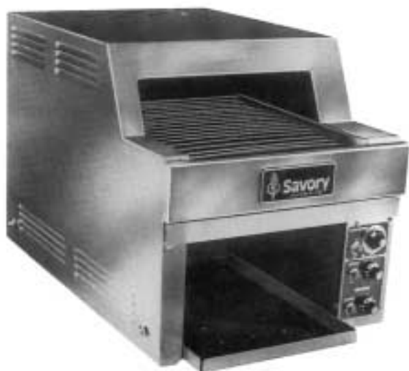
Model RT-2AR Shown

At last...the one toaster that does everything you want a toaster to do.