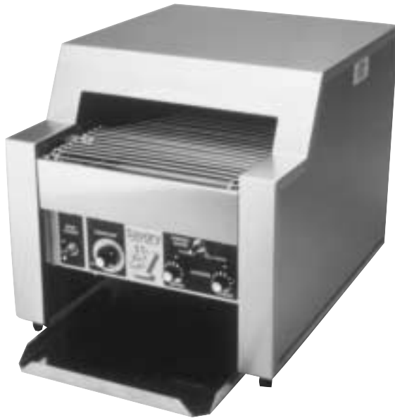
Model ST-1 Shown

The ST-1 uses less power and takes less space – but gives big conveyor convenience and output!