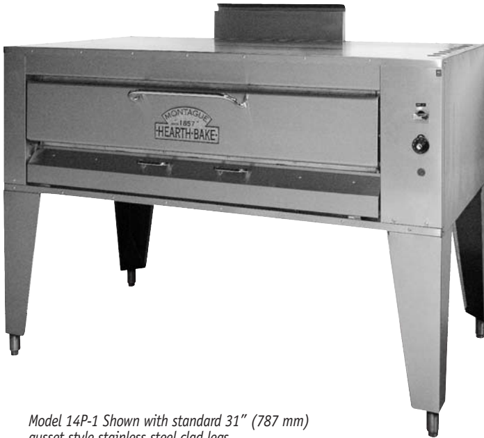
Model 14P-1 Shown with standard 31" (787 mm) gusset-style stainless steel clad legs.