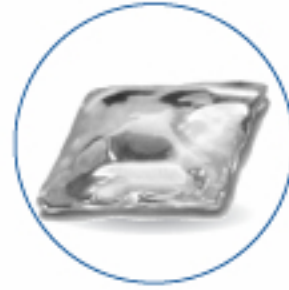
APPROX. CUBE SIZE: 1 3/8" X 1 3/8" X 1/8" THICK