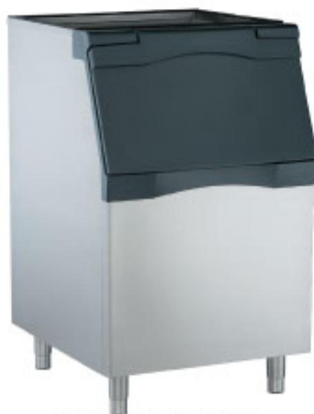
B530S shown with optional KLP85 legs