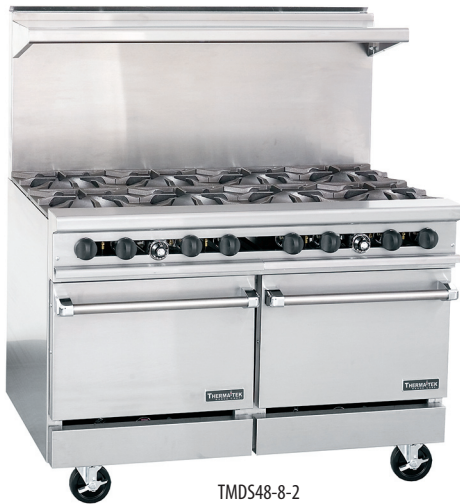
TMDS48-8-2 (Optional casters shown)

NOTE: Ranges supplied with casters must be installed with an approved restraining device.