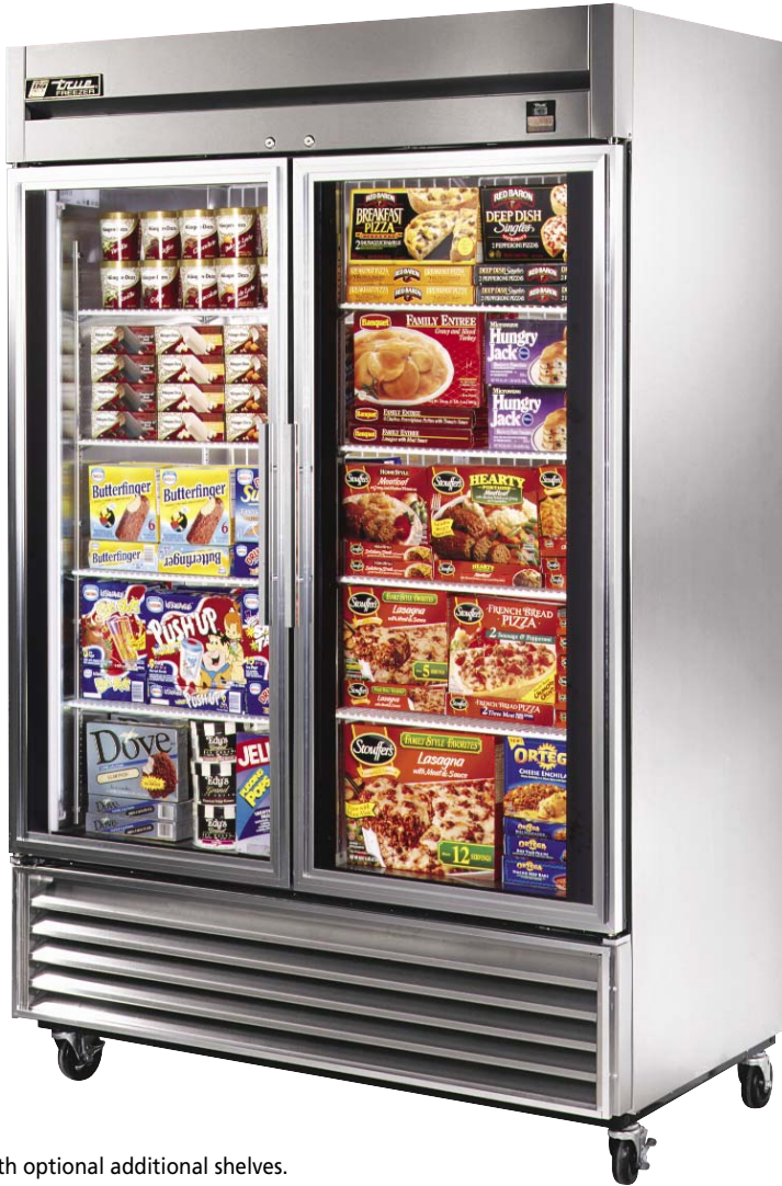
Shown with optional additional shelves.

TS Series: Reach-In 300 Series Stainless Steel Glass Door Freezer