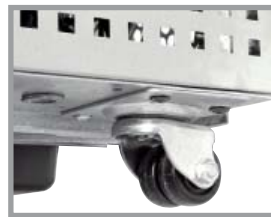
Dual swivel castor for "LP" models.