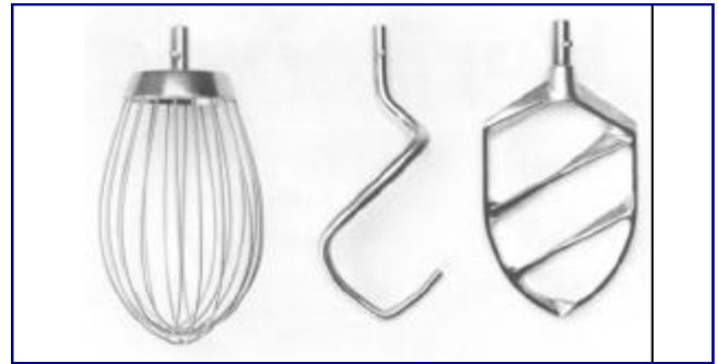
Standard tools: Whip, hook, beater

*On the nominal motor voltage + or - 10% tolerance is allowed. Specifications are subject to change without notice.