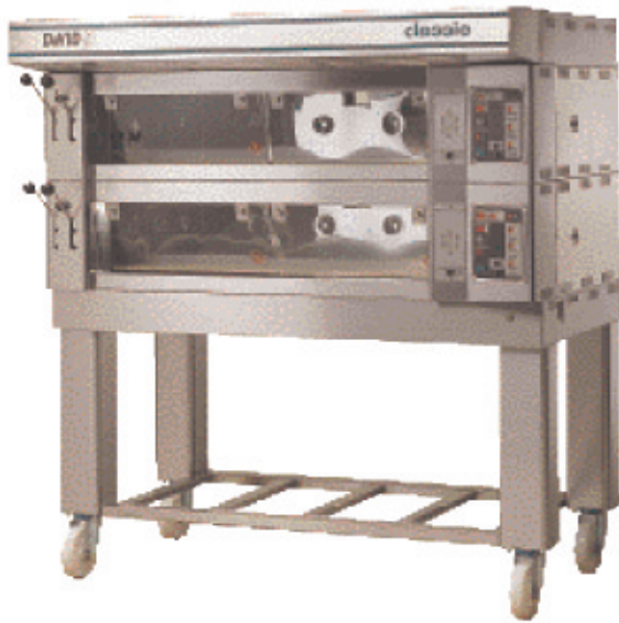
Progress SL is available with baking module, that internal high could be 18 or 26 cm and the external one 29 or 36 cm.

Progress SL results from years of research by a team of technicians, that have been able to make a revolutionary electric oven, modular , highly versatile , able to bake any type of product with maximum uniformity and with reduced influence on operating costs. The baking of the products occurs on refractory surfaces in ovens, that are stoked by clean energy and don't leave ash residues or soot, injurious to health. The recent restyling has permitted to create PROGRESS SL CLASSIC , with doors totally made of glass, and PROGRESS SL ELEGANCE , with doors of stainless steel.