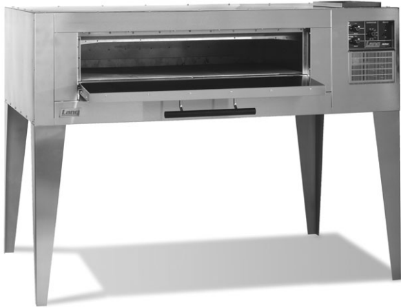
Model PPP-1 shown