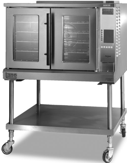
Model ECCO-PT shown, with optional 27" stand.