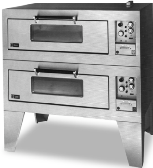
Model D054B2 shown