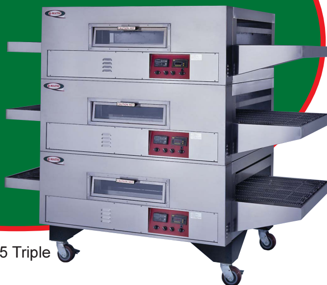
Q-Matic 55 Triple