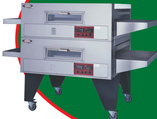
Q-Matic 55 Double