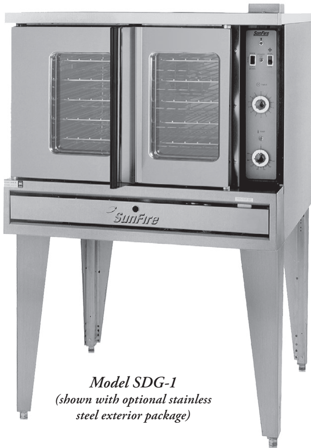
Model SDG-1 (shown with optional stainless steel exterior package)