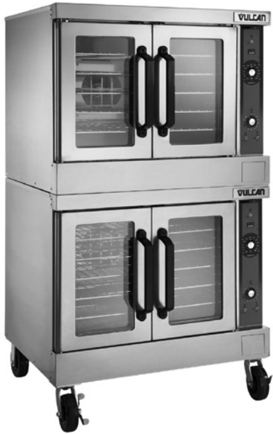
Model VC44ED Shown with optional casters