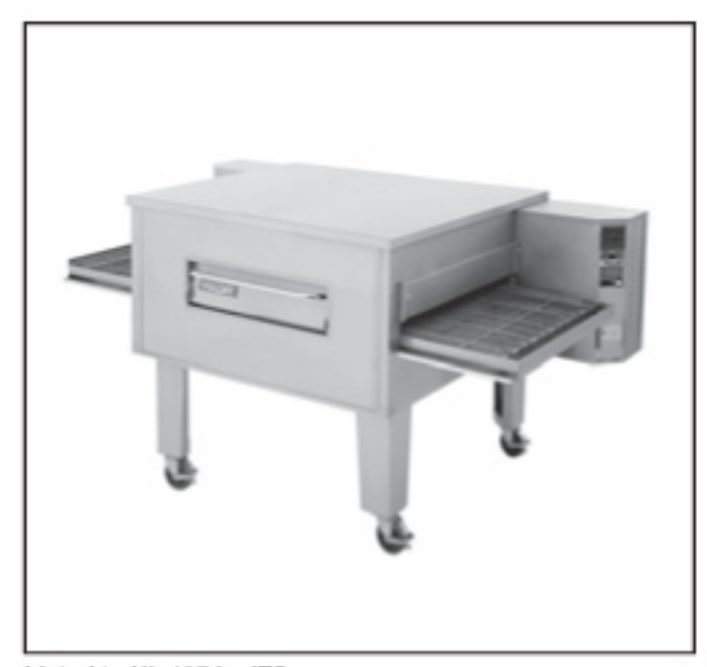
Listed to UL 197 by ITS Classified to ANSI/NSF Standard 4 by ITS Certified for Canada