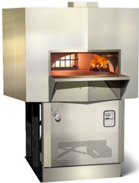
Oven shown with optional stainless steel mantle.